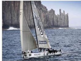
Investec LOYAL - Source: Reuters

Soon after crossing the finish line a protest accusing a LOYAL crew member of seeking outside assistance was logged, but dismissed yesterday.